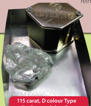
115 carat, D colour Type Ila diamond that Gem Diamonds recovered in September.

In April 2017, a 110 carat gem-quality light yellow diamond was also recovered during the ramp-up phase at Liqhobong.