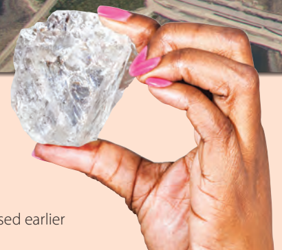
Lesedi La Rona.